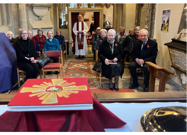
9am service in The Pye Chapel

Different styles of worship are incorporated into the life of All Saints. Our worship is a mixture of contemporary and traditional, led by a music group which plays a variety of instruments - including piano and guitar. We are always looking to expand this range. We also have a beautiful organ, which is used regularly for some traditional hymns.