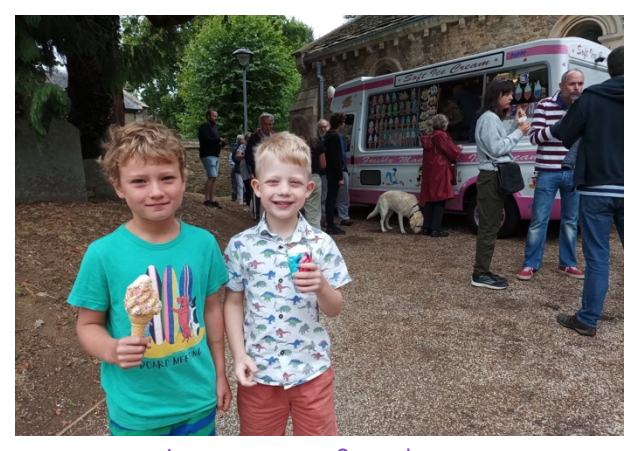
Ice cream Sunday

park). As a welcome back for families, we held an "Ice Cream Sundae" Sunday on the first Sunday in September at the 10.30am service. This now continues for all as an annual part of church life.