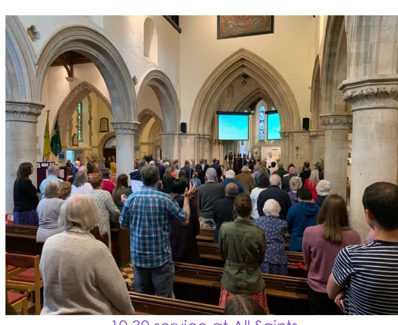
10.30 service at All Saints

Our services are characterised by variety whether formal or informal, clergy- or layled. We are warmly evangelical: the Bible is central to our faith and we aim to 'correctly