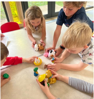
Junior Saints recreating a story