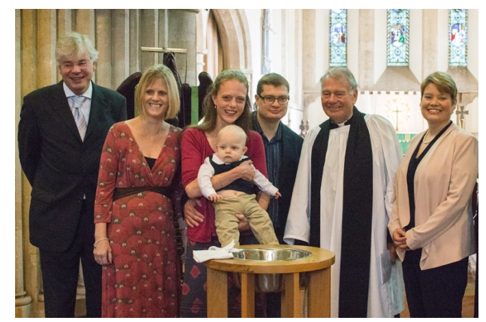
Baptism with the new font

Many of Faringdon's residents bring their children for baptism; there are large and lively baptismal services (on Sundays at 10:30) every few months. This year we have a waiting list for families wanting their children baptised. The church is also used for weddings and funerals by many across the town.