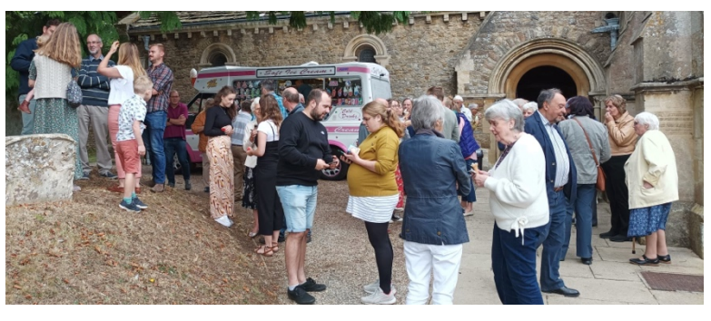
Left: Funeral procession at All Saints