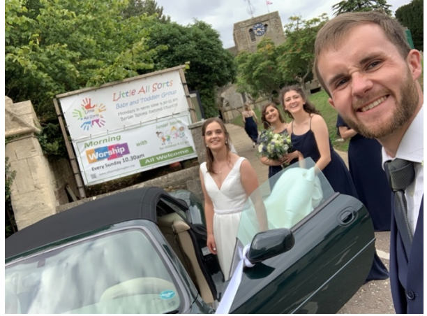
A recent wedding at All Saints