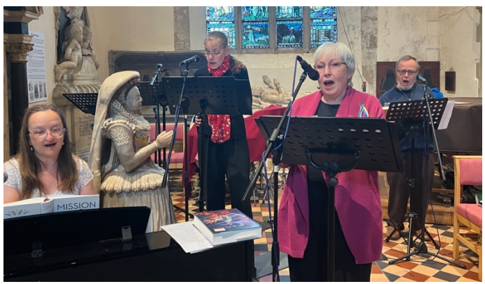
The worship group at All Saints

Women and men are equally represented in every aspect of ministry, leadership, welcome and support. With sensitive leadership, we as a church want to grow in both in number and in depth of faith.