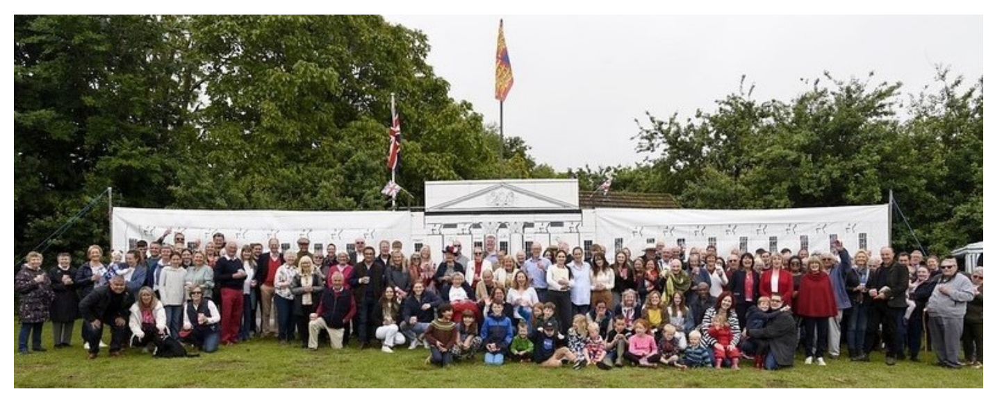
A jubilee celebration in Little Coxwell

Little Coxwell has a modern and very well equipped Village Hall which is used for church and other village events, as well as being hired out for private functions. There is no village shop but local farmers sell some produce. The village pub, The Eagle Tavern, serves excellent food and is well supported by both the village and the wider community. Most villagers commute further afield for employment. A few work in the village, mainly in farming, estate management and equestrian activities. The headquarters of the Hurlingham Polo Association is located here. There are allotments providing produce, including for the Harvest Festival.