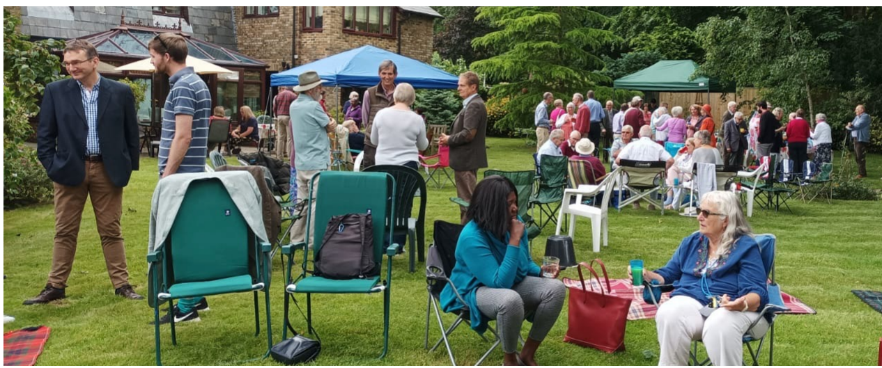
A summer garden party