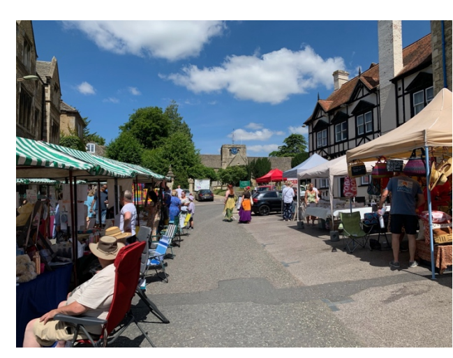
range of churchmanship. St Mary's, A view of All Saints during a town event Little Coxwell is in the same benefice as All Saints.

Part of the diocese of Oxford, All Saints ministers to a fast-growing market town and is a warm, openhearted part of God's family. The church is open evangelical in character and benefits from a broad range of churchmanship. St Mary's,